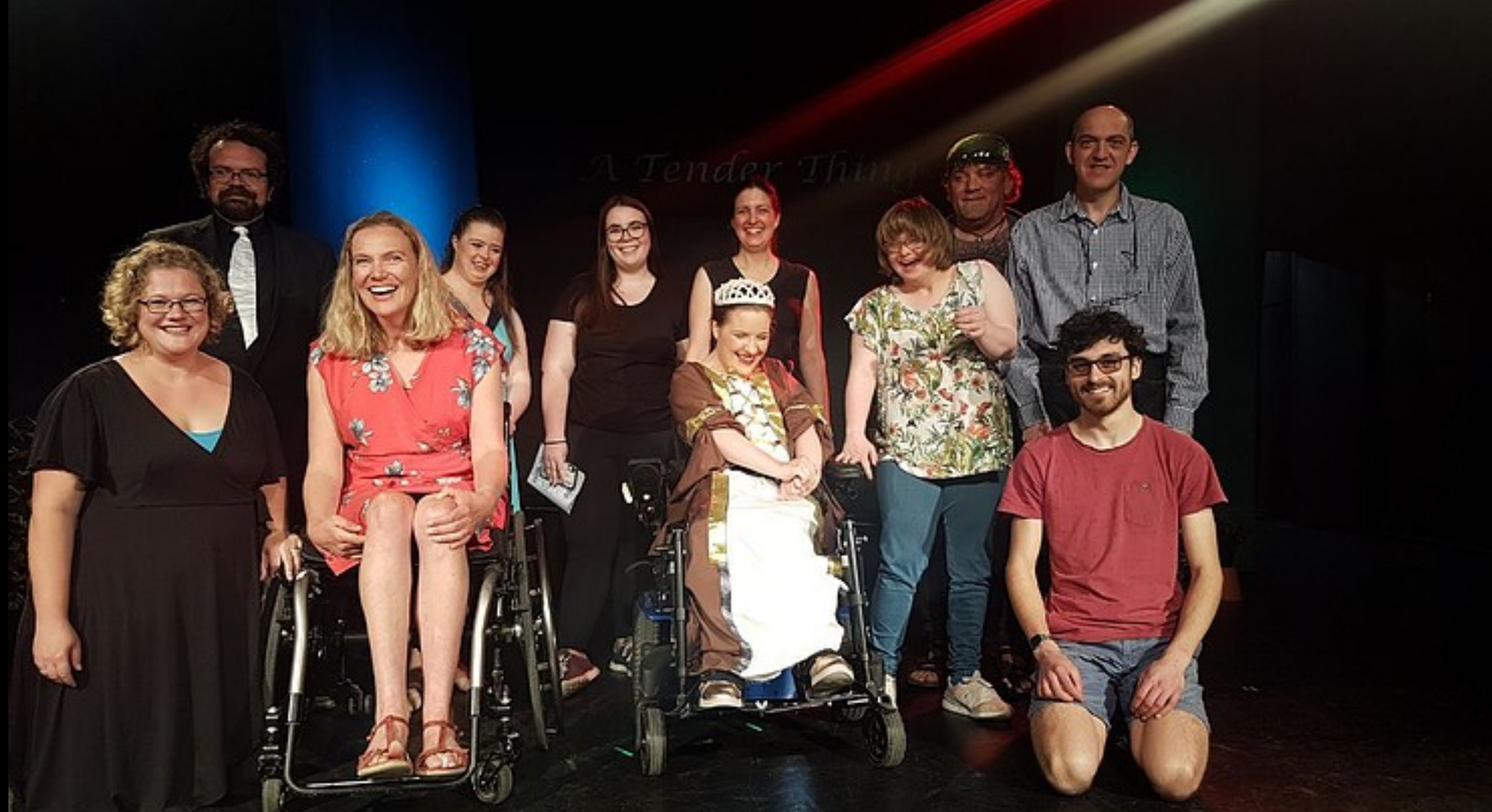
Cast of 'A Tender Thing'