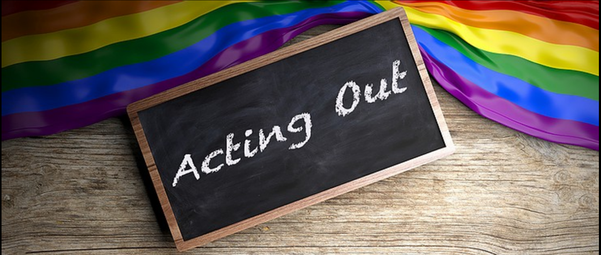
Acting Out Inclusive Drama Classes

Free inclusive drama program for LGBTQIA+ Youth aged 12-17 yrs